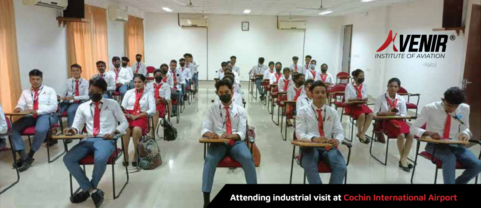
Attending industrial visit at Cochin International Airport